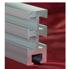
Strong & sleek profile