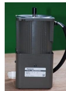
Quality Japanese Motor