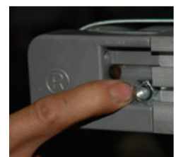
Easy nut insertion

▪ Standard Width in 50mm increments, standard Length in 50cm increments.